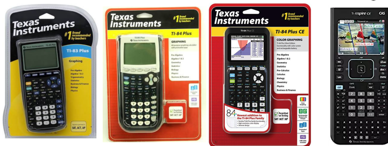
TI-83 Plus TI-84 Plus TI-84 Plus CE TI-Nspire

Graphing calculator is strongly recommended for the course. TI-84 Plus or Plus CE is highly recommended. This calculator is widely used in math, science, and engineering courses. You are required to bring a physical calculator to the exam, and sharing calculator is considered as cheating incident. Using the calculator apps on your phone is strictly prohibited on the exam. Do not purchase the TI-Nspire Graphing Calculator (around $150) because it is too advanced for this course. Instructions will not be provided for TI-Nspire.